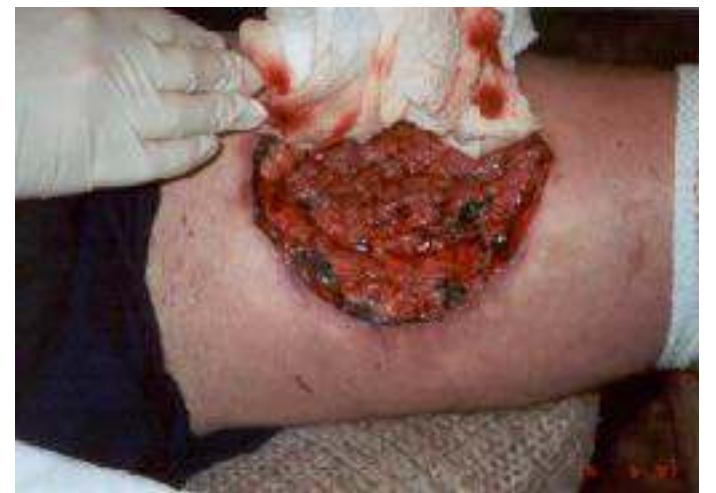
Brown Recluse Spider Bite